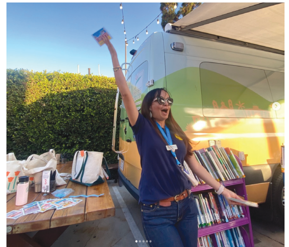
The Library Van on the Go celebrating the week at Shalhoob’s in the Funk Zone.