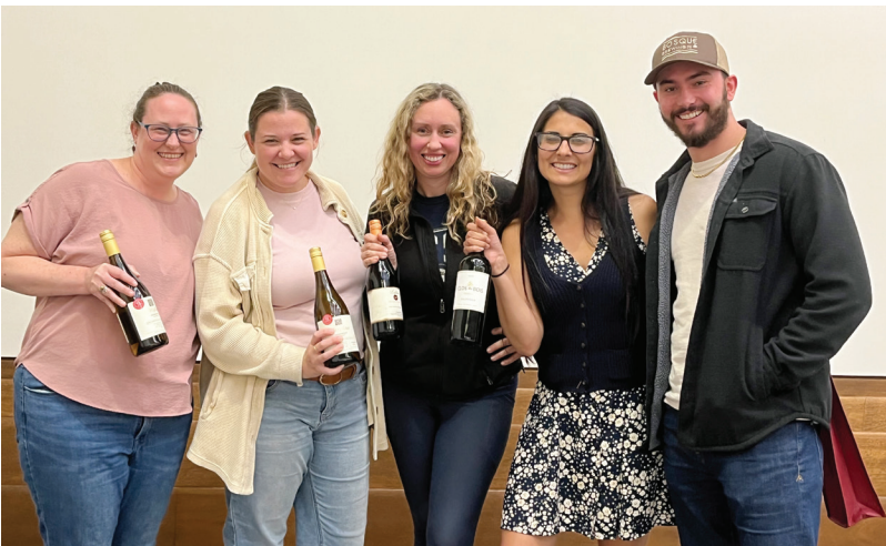
Despite some fierce competition, “It’s Lit” was the winning team at our Literary Trivia Night!

On Friday night, the Friends held our third annual Literary Trivia Night, where an enjoyable time was had by all the book lovers in attendance.