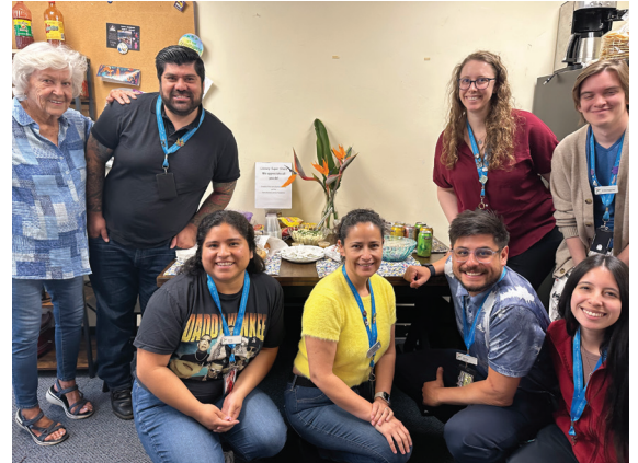
The staff of the Eastside Library enjoying lunch provided by the Friends.