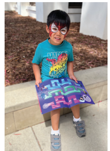
A happy young reader at the children’s book sale!