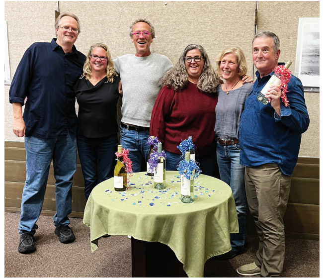
Team Literati proudly displays their bottle of wine after their win at the Literary Trivia Night.