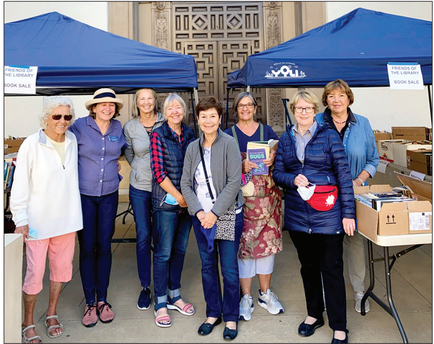
FOL Board Members worked hard putting together a successful sidewalk used book sale and had fun besides! (story inside)