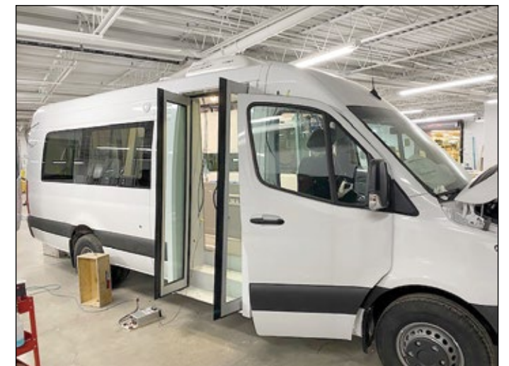
Getting the Van ready to become the new mobile branch of the Santa Barbara Public Library! The van will contain books to browse through and technologies which will provide a wide range of programs and workshops for the local visitors!

The Women's Fund of Santa Barbara provided a $100,000 grant, which allowed the Library to move forward with the project. The Santa Barbara Public Library Foundation also contributed some funding.